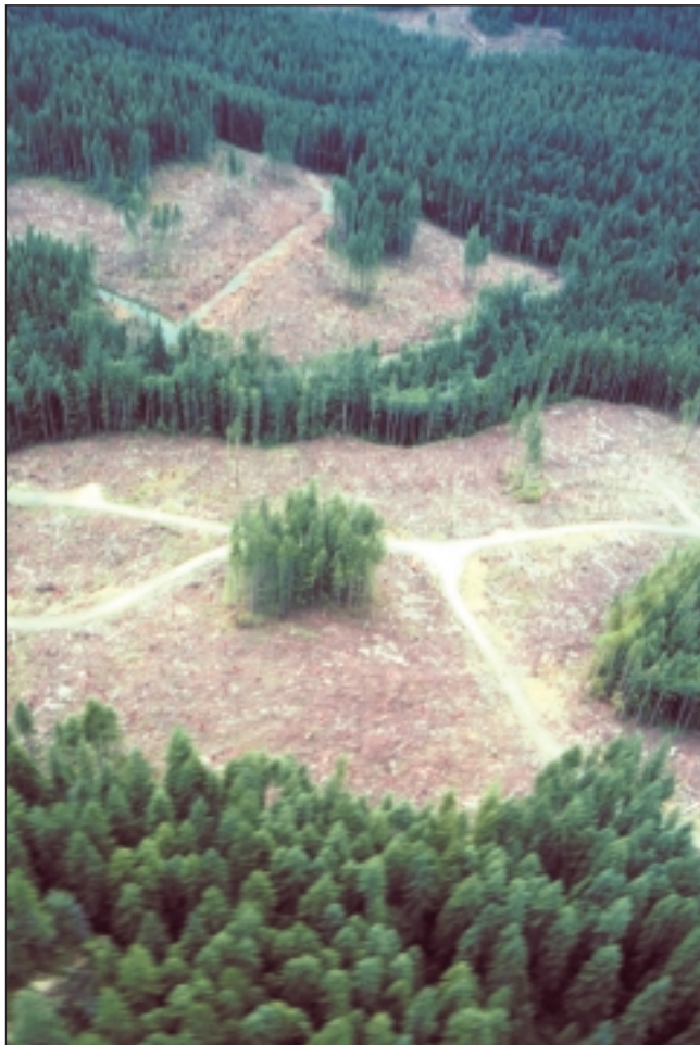
Figure 2. Retention harvesting to maintain structural complexity in the matrix and provide stepping stones for organisms on Vancouver Island, Canada.

The maintenance of a structurally complex matrix is particularly important where the proportion of land occupied by the matrix is large, and where areas of native vegetation are small or poorly connected.