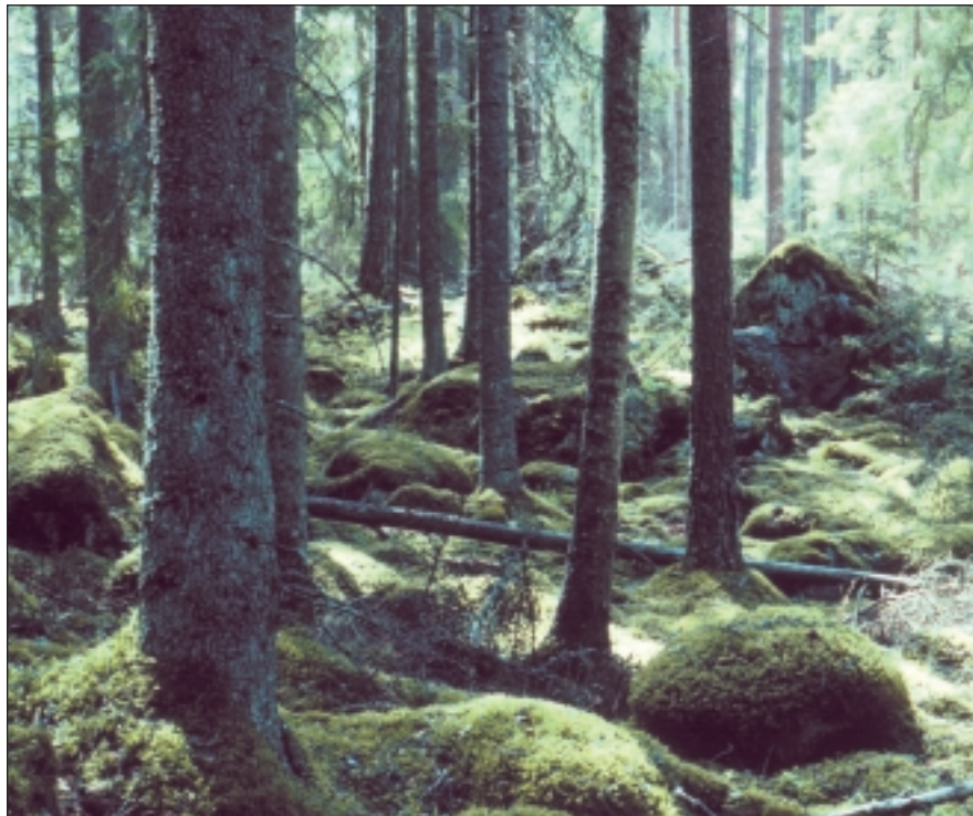
Figure 1. Structurally complex forest in the northern Ural Mountains, Komi Province, Russia.

The area surrounding patches of native vegetation is often termed the “matrix” (Forman 1995). The matrix is the dominant landscape element, and exerts an important influence on ecosystem function. A matrix that has a similar vegetation structure to patches of native vegetation (ie that has a low contrast) will supply numerous benefits to ecosystem functioning. Three key benefits of a structurally complex matrix are the provision of habitat