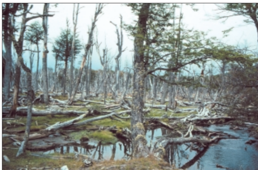
Figure 4. Tierra del Fuego, South America. Aquatic and forest ecosystems in this area have been severely altered by the invasion of beaver ( Castor canadensis ) introduced from North America.

The above guidelines have focused on maintaining biodiversity in general, and functional groups in particular, with the aim of maintaining ecosystem resilience. These approaches are likely to benefit a number of different species. However, some species may still “fall through the cracks” (Hunter 2005). Unless they are keystone species, highly threatened species are often very rare, and may contribute lit-