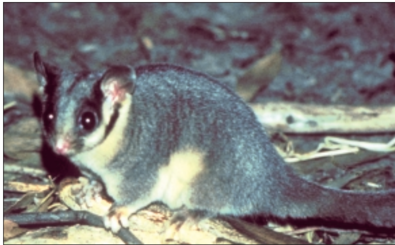
Figure 5. Leadbeater's possum ( Gymnobelideus leadbeateri ), an endangered marsupial in the Central Highlands of Victoria, Australia. Highly targeted management strategies are required to maintain viable populations of this species.

and financial perspective. Future work may be most effective if it is interdisciplinary and considers both conservation and production objectives.